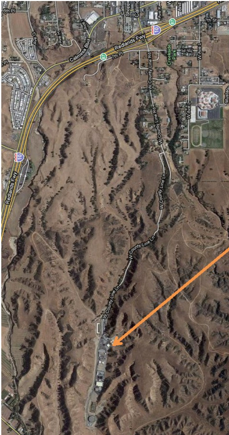
Wochholz Regional Water Recycling Facility 880 West County Line Road, Yucaipa