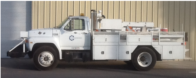
1988 Chevy C-70

Each year the District staff reviews the operating condition, cost and maintenance of fleet vehicles and equipment to evaluate the overall maintenance and replacement needs. This year the District staff has identified the need to replace two service trucks, a 1988 Chevy C-70 2-ton and a 1990 Ford 2-ton.